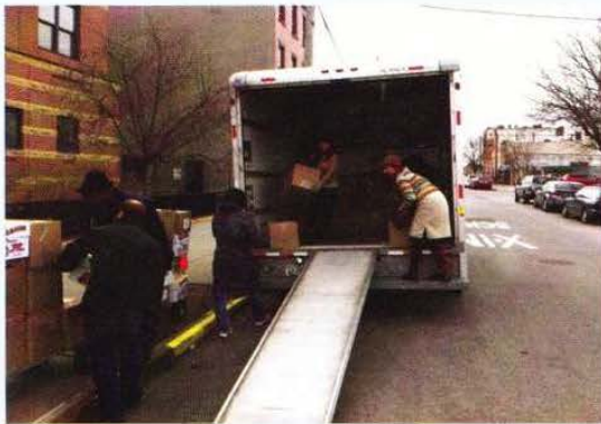
unloading the truck in Brooklyn