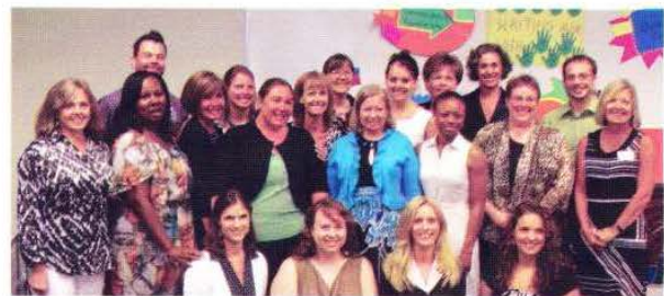
New West Chester Fellows!