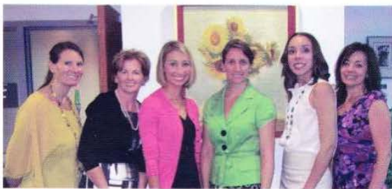
New Bucks County Fellows!

The Invitational Institute is the heart of every one of the