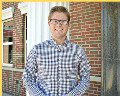
https://www.dailylocal.com/news/local/henderson-high-band-director-earns-top-award/article_42711b80-6691-11e9-9729-37843b990430.html